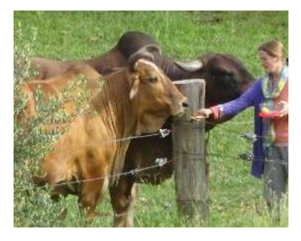
Our Brahman cows at Om Shree Dham supply us Homa organic cow dung for our Homas