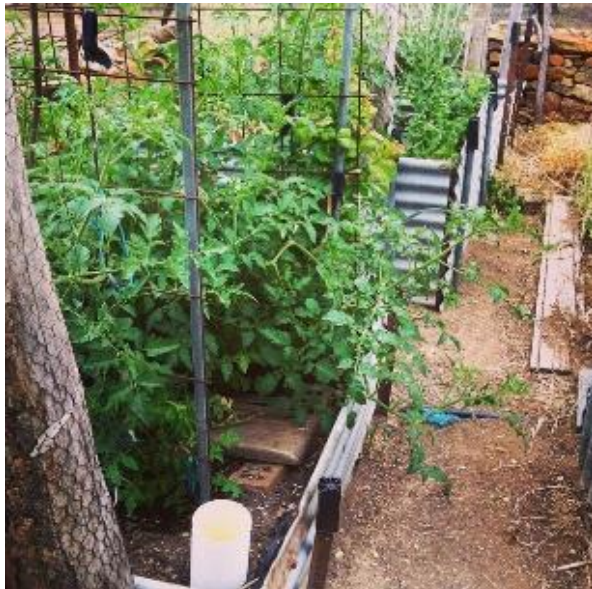
Our healthy veggie garden

We often have feedback from guests, that they feel a sense of rejuvenation, well-being and peace when staying here. Indeed, both my partner and I find it a wrench to leave our property whenever we need to work away from home. We have become sensitive to harmony- it's quite tangible, this absence of it.