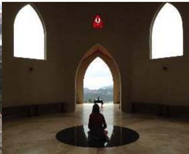
Crystal sounding and toning in Chapel