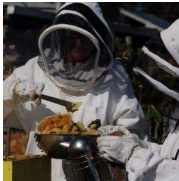
Agnihotra creates medicinal honey