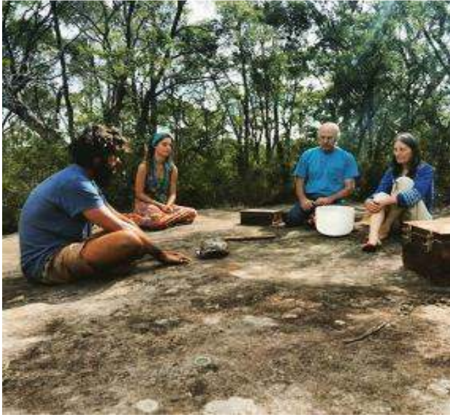
Homa and crystal sound bath at sacred indigenous site Hunter Valley - NSW