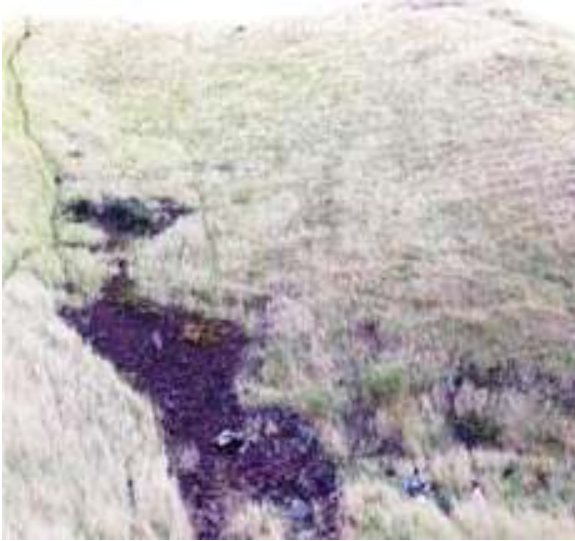
Agnihotra in Mt Wellington crater