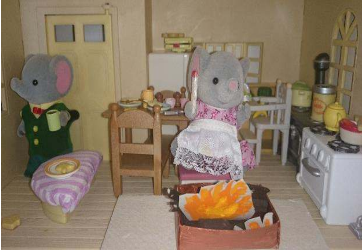
Here is a picture of our daughter's dolls house!